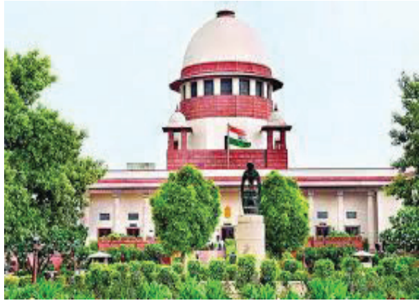
ದಂಪತಿಗಳ ನಡುವಿನ ದಾವೆಗೆ "ಶಾಂತ" ಅವಕಾಶ ನೀಡಿತು. 1994 ರಲ್ಲಿ ತಮ್ಮ ಮದುವೆಯಿಂದ ಉದ್ಭವಿಸುವ ಎಲ್ಲಾ ವಿವಾದಗಳನ್ನು ಒಳಗೊಂಡ ಇತ್ಯರ್ಥಕ್ಕೆ ಪಕ್ಷಗಳು ಸ್ವಯಂಪ್ರೇರಣೆಯಿಂದ ಬಂದಿವೆ

ನವದೆಹಲಿ, 4: ದೇಶಾದ್ಯಂತ 60 ಕ್ಕೂ ಹೆಚ್ಚು ಪ್ರಕರಣಗಳಲ್ಲಿ ಹರಡಿದ್ದ ದಶಕಗಳ ವೈವಾಹಿಕ ವಿವಾದಕ್ಕೆ ಸುಪ್ರೀಂ ಕೋರ್ಟ್ ಅಂತ್ಯ ಹಾಡಿದೆ. ವಿಚಾರಣೆ ಪಡೆದ ದಂಪತಿಗಳ ನಡುವೆ ಸಮಗ್ರ ಇತ್ಯರ್ಥಕ್ಕೆ ಅನುಕೂಲ ಮಾಡಿಕೊಟ್ಟಿದೆ ಮತ್ತು ಅವರಿಗೆ ವಿಚಾರಣೆ ನೀಡಿದೆ. ಇದು ಸುಪ್ರೀಂ ಕೋರ್ಟ್ ತಲುಪಿದ ವ್ಯಾಜ್ಯ-ಭಾರಿ ವೈವಾಹಿಕ ವಿವಾದಗಳಲ್ಲಿ ಒಂದನ್ನು ಕೊನೆಗೊಳಿಸಿದೆ.